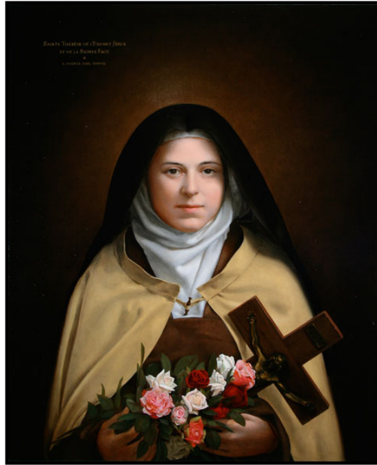
St. Therese of Lisieux

Let us keep our eyes fixed on Jesus, who inspires and perfects our faith!