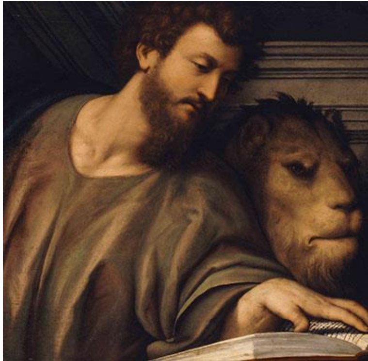
Our Holy Patron: Saint Mark