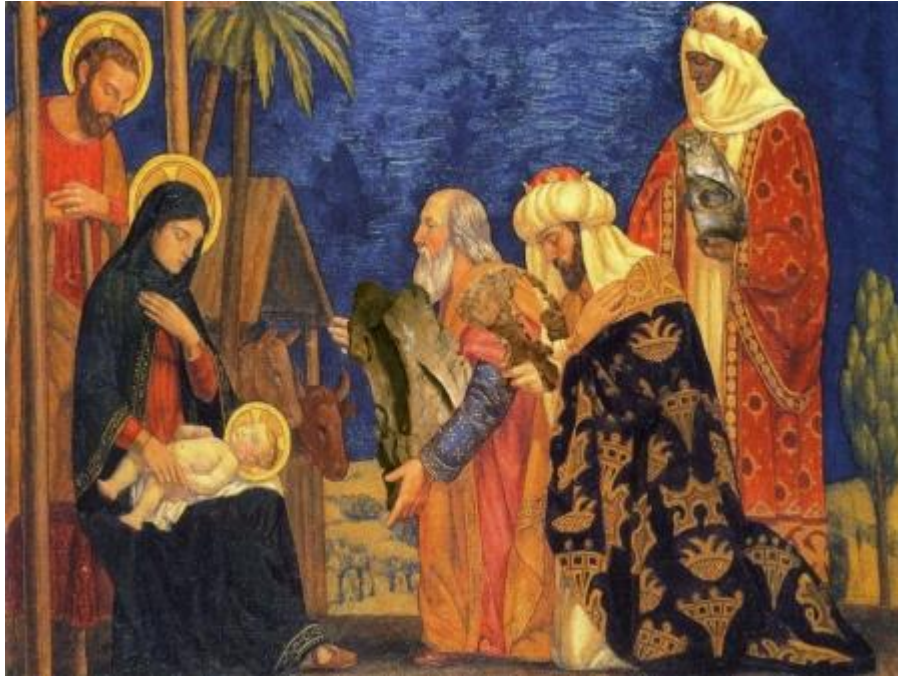
The Epiphany of the Lord