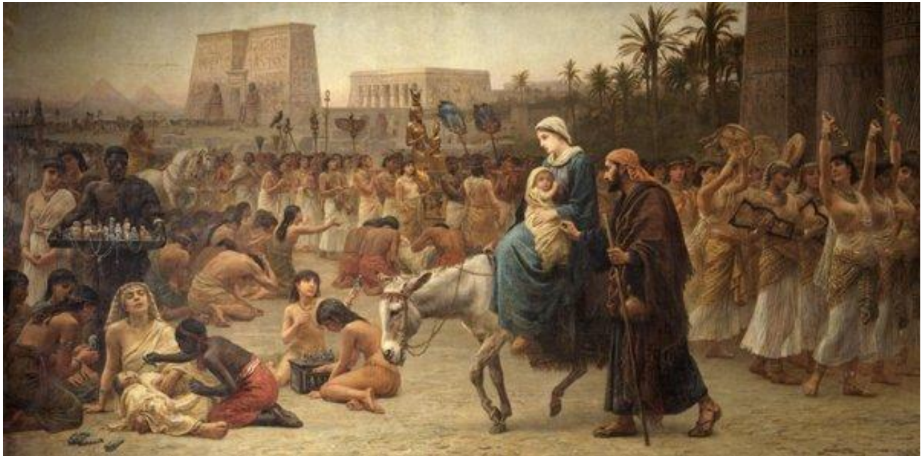
Flight of the Holy Family of Jesus, Mary and Joseph into Egypt