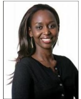
Immaculee Ilibagiza, Immaculee's Story of Faith, Forgiveness, and Healing