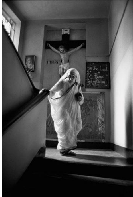
Blessed Mother Teresa of Calcutta