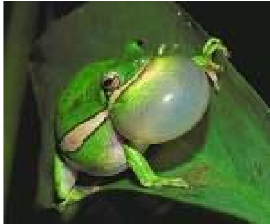
A “big” little tree frog