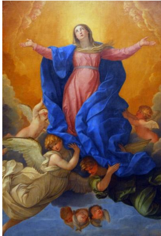
Assumption of the Blessed Virgin Mary