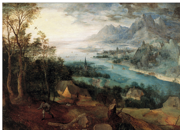
Parable of the Sower, Pieter Brueghel the Elder

As followers of Christ, we have been entrusted with a privileged role in the Lord's work, what a relief it is to know that it doesn't depend