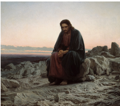
Christ in the Wilderness

Ivan Kramoskoy’s image of Christ in the Wilderness conveys a sense of the Lord that