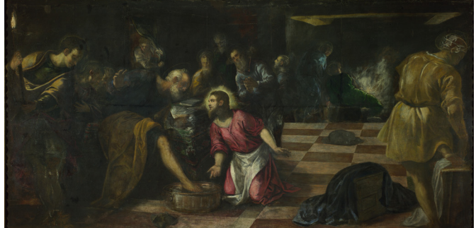
Christ washing the Feet of the Disciples, Jacopo Tintoretto

At first reading, it is tempting to apply this description to those around us - looking to the various authority figures in our lives and echoing Jesus' evaluation. And while there may be some merit to those kinds of complaints, this is a temptation because it turns the Lord's words away from their intended target: us!