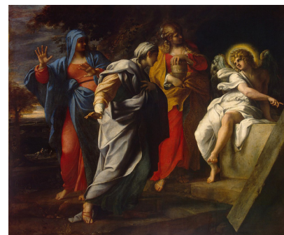
Holy Women at Christ's Tomb

Saturday, July 22 is the feast of Saint Mary Magdalene . Though it has been on the liturgical calendar for many years, Pope Francis only recently (2016)