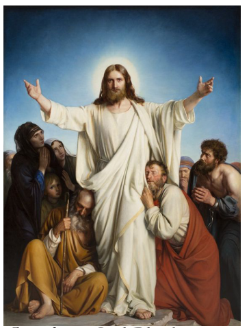
Consolator, Carl Block

Zephaniah prophecizes that there will be left on earth a remnant of God's people - humble and lowly. Saint Paul's words to the Corinthians punctuate what we may not wish to hear - that not many of us are wise, powerful, or noble. In the Beatitudes, Jesus lays out a litany of blessings that seem like anything but!