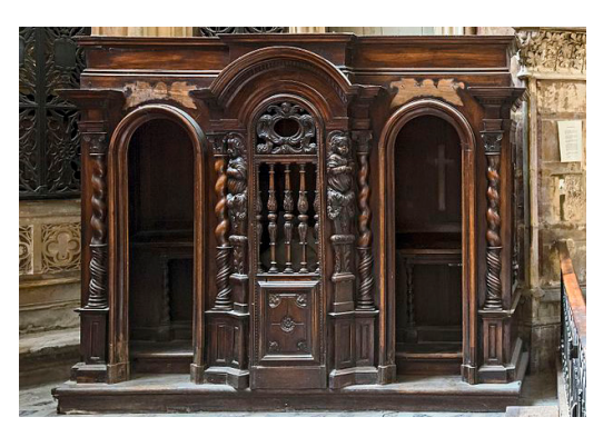
Advent 2022 confession schedule: (Wed., Nov. 30 to Fri., Dec. 23) Wednesday, Thursday & Friday 5:00 pm—6:00 pm Saturdays as normal (3:00 pm - 4:30 pm)

It's the last week of Advent, but there is still time to go to confession before Christmas. Come celebrate God's mercy & love in anticipation of the Nativity of the Lord!