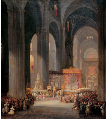
The Corpus Christi Procession Genaro Pérez Villaamil

This an opportunity to worship the Lord in praise & adoration - consider joining us one (or each!) Sunday inside Seville Catedral as we pray together.