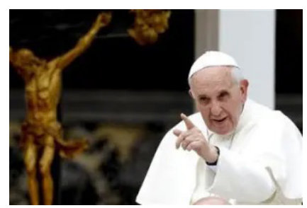
Saint Mark's needs YOU!

As we begin to resume normal parish life at Saint Mark's, we find ourselves in a unique opportunity to rebuild long-