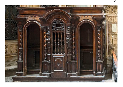
Lent 2022 confession schedule:

The season of Lent is an excellent time to come to the sacrament of Reconciliation. Especially if it has been a long time, please take this time to celebrate God's mercy.