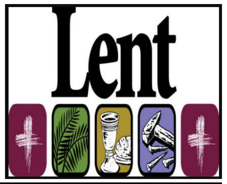
Parish Events & News, Page 3

Lent is a good time to help contribute back to our community. We can help those less fortunate by volunteering our time, we can contribute food or money to our St. Vincent de Paul society. We can give to our St. Vincent de Paul society, or any St. Mark endeavor, securely through our online giving platform here, <u>https://www. osvhub.com/saintmarkshoreline/funds</u>