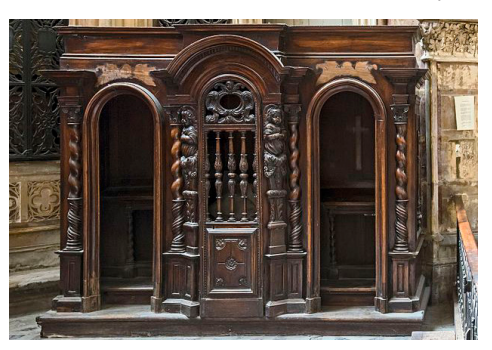
Lent 2022 confession schedule: (Wed., March 2 to Wed., April 13) Wednesday, Thursday & Friday 5:00 pm—6:00 pm Saturdays as normal (3:00 pm - 4:30 pm)

The season of Lent is an excellent time to come to the sacrament of Reconciliation. Especially if it has been a long time, please take this time to celebrate God's mercy.