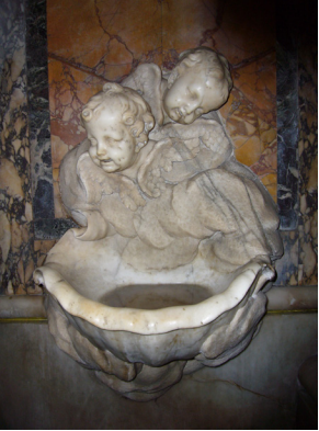
From the desk of the pastor

sacrament by which we entered the Church. How fitting that this is done as we enter into our local church, preparing to celebrate the Mass. Praise God for this renewed opportunity to so bless ourselves!