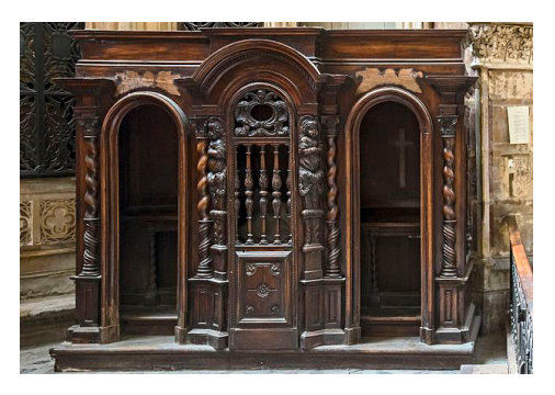
Lent 2021 confession schedule: Wednesday, Thursday & Friday 5:00 pm—6:00 pm (Wed., February 17 to Wed., March 31)

This coming week is the final full week of the Lenten confessional schedule (below). Especially if it has been a long time, consider coming to confession in preparation for Holy Week, the Triduum celebrations, and Easter!