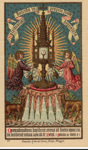
From the desk of the pastor

Regardless of how long you can stay, this is a wonderful opportunity to be with the Lord and each other in prayer & worship.