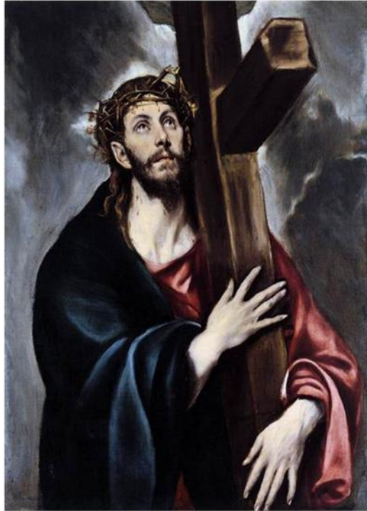
Christ Carrying the Cross by El Greco

“And I saw a river over which every soul must pass to reach the Kingdom of Heaven, and the name of that river was ‘suffering’ . . . . And then I saw a boat which carries souls across the river, and the name of that boat was ‘Love.’” St. John of the Cross