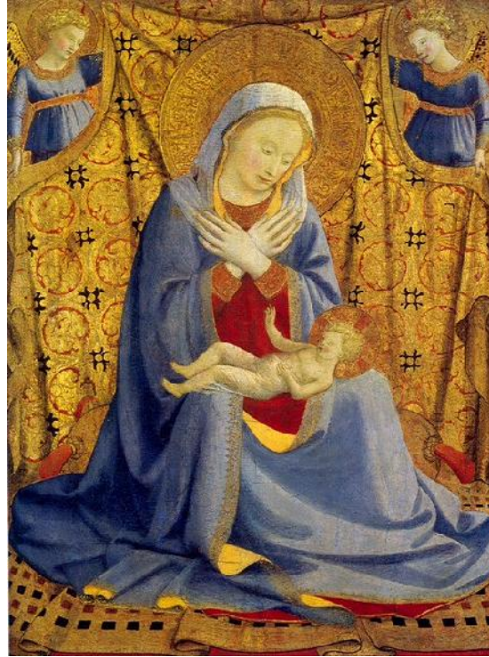
Mary, Mother of God