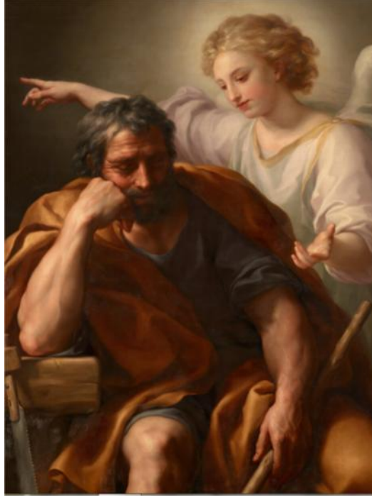
Saint Joseph the Dreamer