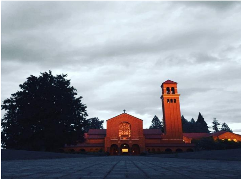
Mount Angel Abbey & Seminary, Saint Benedict, Oregon