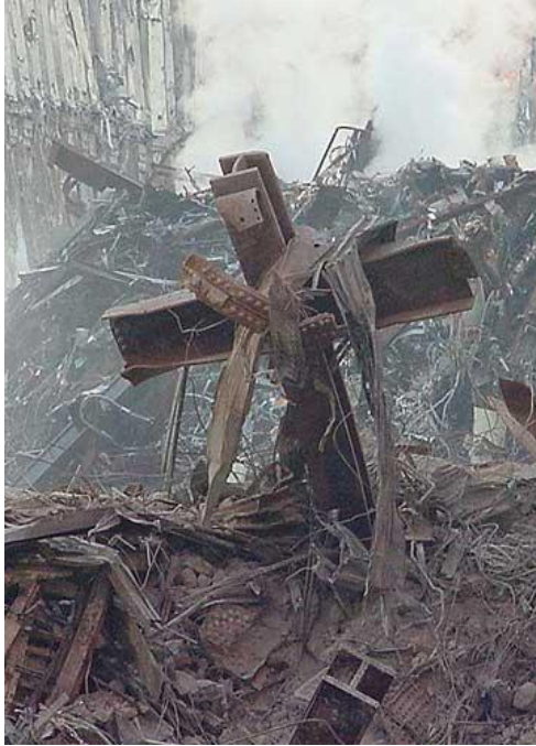
The 9/11 Cross