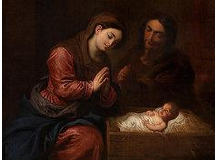
The Lord's Nativity