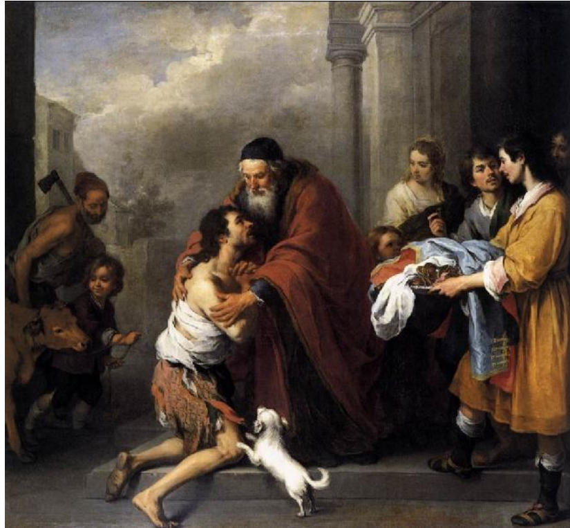
The return of the Prodigal Son to the merciful Father