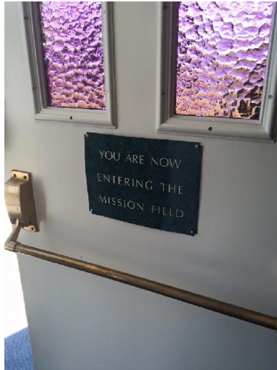
Exit Door: Saint Katherine Parish - Enterprise, Oregon