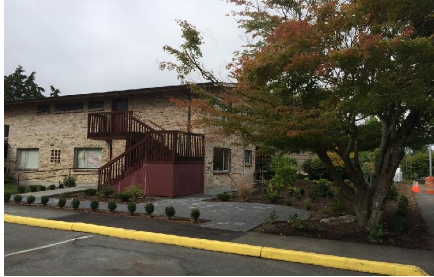
Changes at the Parish Office.....