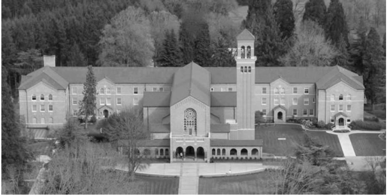
Mount Angel Abbey and Seminary, St. Benedict, Oregon