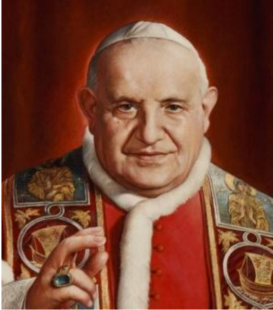
St. John XXIII - "The Good"