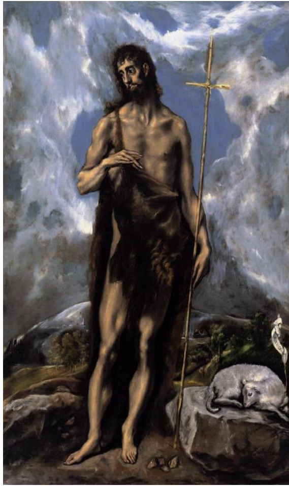
St. John the Baptist by El Greco