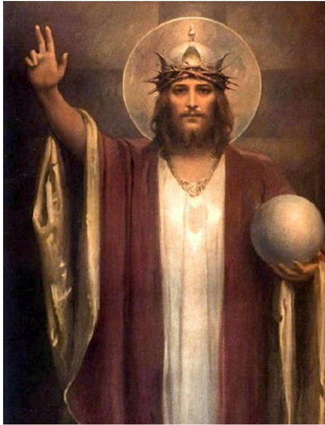
Our Lord Jesus Christ, King of the Universe