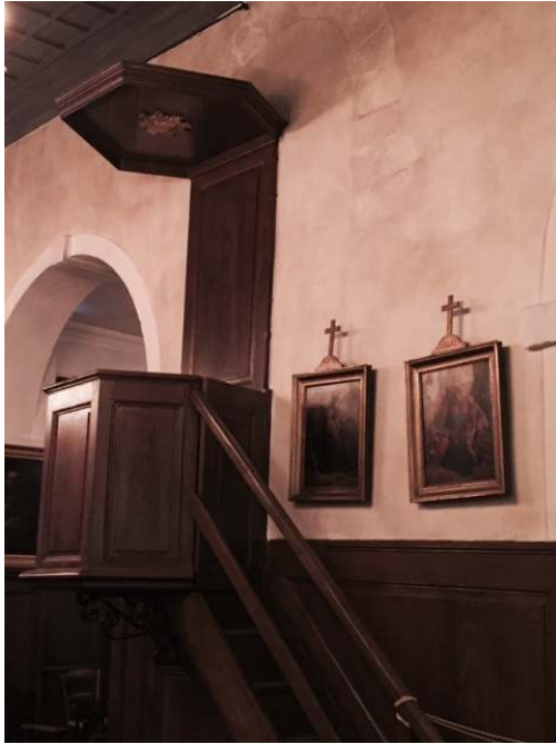
The Ambo at Ars, France