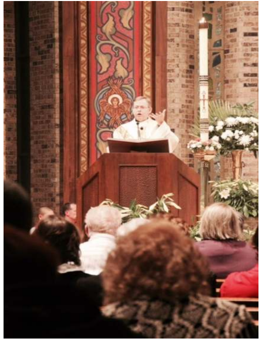
The Ambo at Shoreline, USA