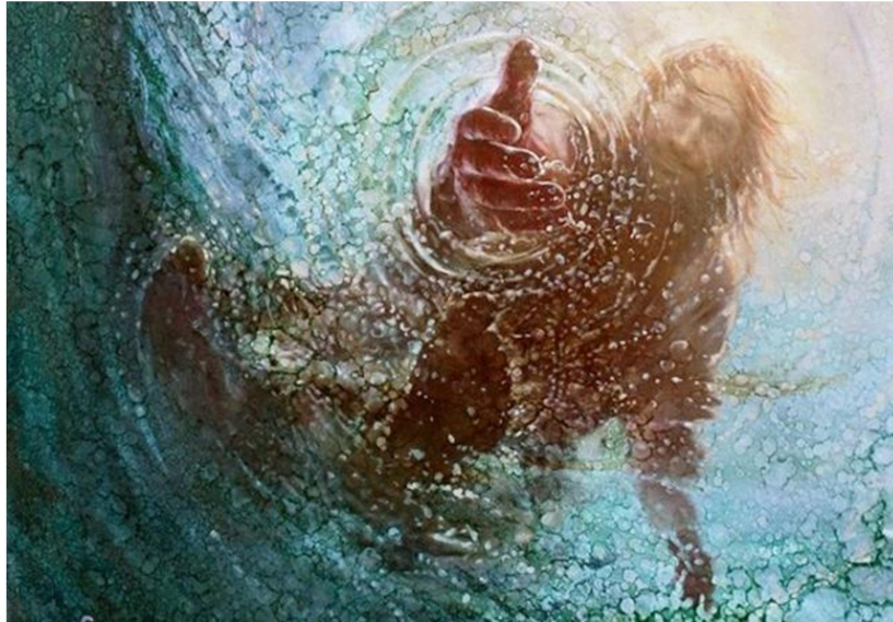
"Lord, Save me!"