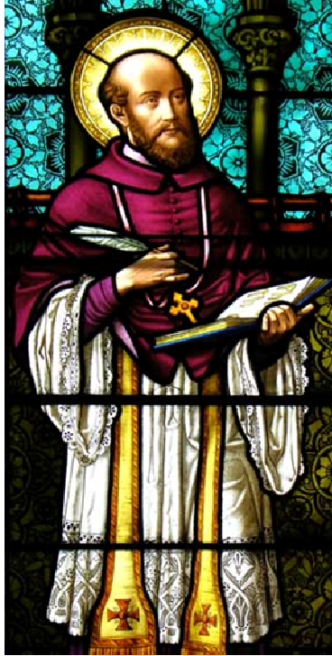
St. Francis de Sales

Let us keep our eyes fixed on Jesus, who inspires and perfects our faith!