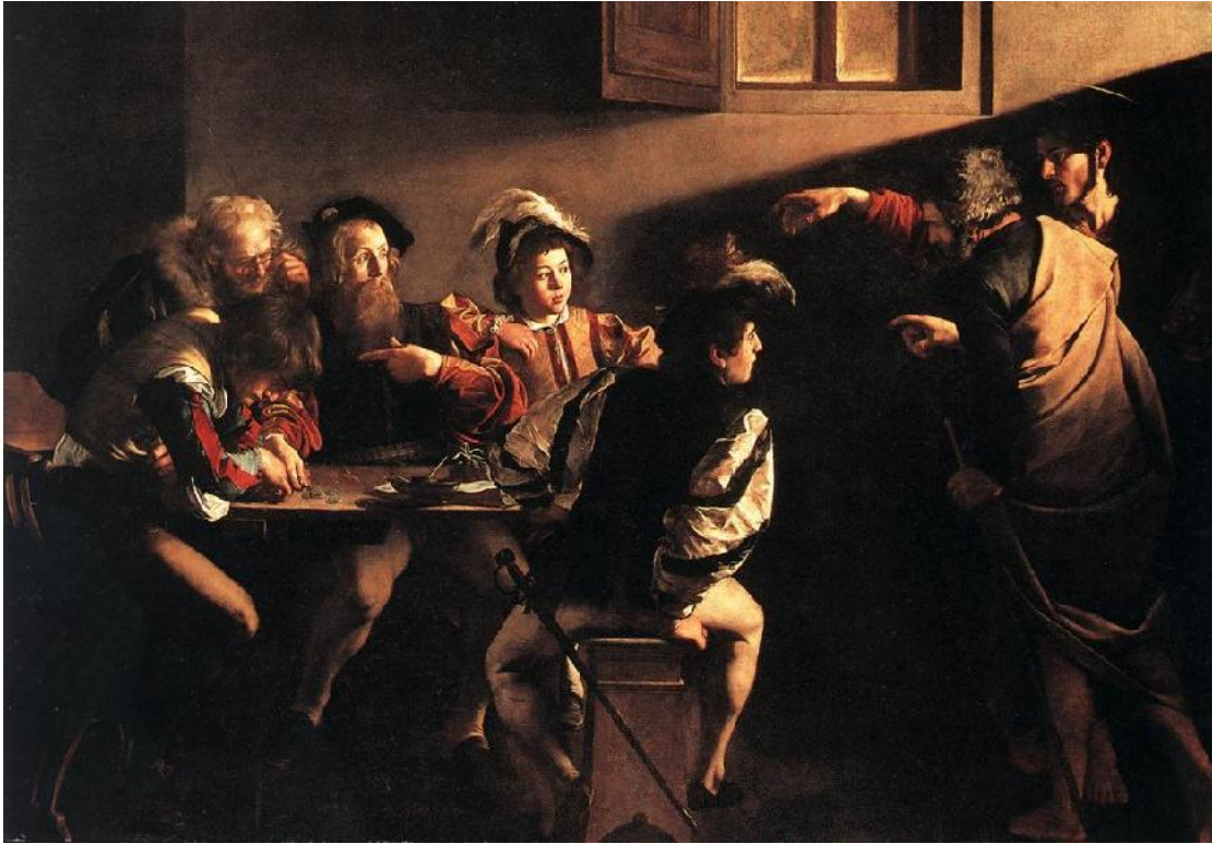
The Call of Saint Matthew by Caravaggio